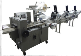
3-Station into Wrapper

Maximize your throughput with an XM One-Shot Collator. This powerhouse is the most robust, advanced system in the world built for high-volume 24/7 production environments. Produce standard or variable collated sets. Configure two to 50 stations with line speeds of 10 to 200 stacks/min. with options to allow for products from 3" to 30" wide!