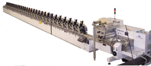
32-Station into Wrapper