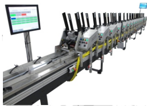
18-Station Collator with SmartControl PLC