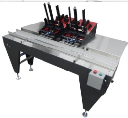
2-Station RX Collator

RX One-Shot Collators are the most affordable collating lines on the planet, offering the quickest ROI. Fast, easy setups make RX Collators the obvious choice for most standard collating & kitting applications. Configure two to 50 station with line speeds of 10 to 60 stacks/min for products from 3" to 12" wide,