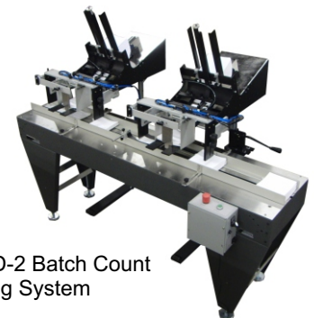
Shown: RXSD-2 Batch Count Collating System

Options available include: BT-II Batching Tray, Piece Counter, Double Detect, Height Adjustable Mounting Stand, and External I/O Cable.