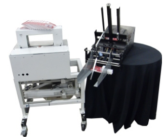
Add a BT-II Batching Tray for offline batch counting with banders

Two thumb dials are set to count 1 to 99 pieces at a time. When the trigger receives a signal, this will engage the feeder to dispense the set number of pieces. The RX-12bc can also act as a continuous feeder for ink-jet printing, labeling, and tabbing applications.